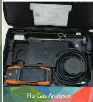
Flu Gas Analyser

Your tools empower you to excel in delivering your services and driving productivity and performance.