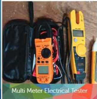
Multi Meter Electrical Tester