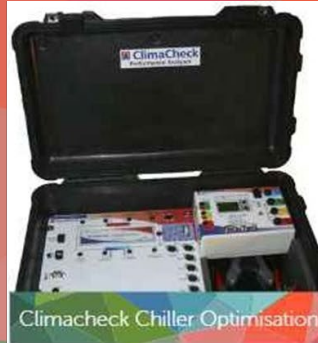
Climacheck Chiller Optimisation