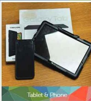
Tablet & Phone